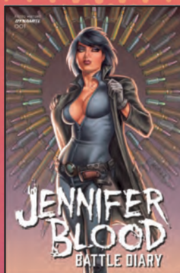
Jennifer Blood TM & © 2023 Dynamite & Spitfire Productions, Ltd. All Rights Reserved.