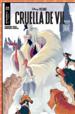
Disney Villains: Cruella De Vil © Disney Enterprises, Inc. Based on the book THE HUNDRED AND ONE DALMATIANS BY DODIE SMITH. Published by The Viking Press.