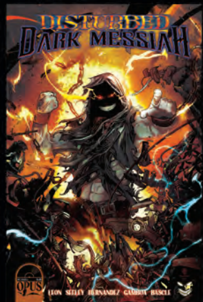
COVER A LEONARDO COLAPIETRO

NOT PICTURED: COVER B Thor Homage - Agustin Alessio (1:5) COVER C Nat Jones (1:10)