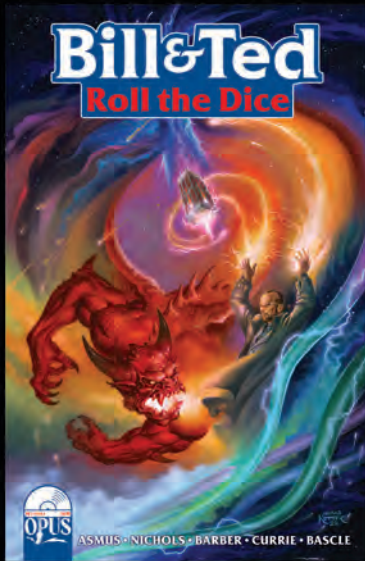
COVER A LUKAS KETNER