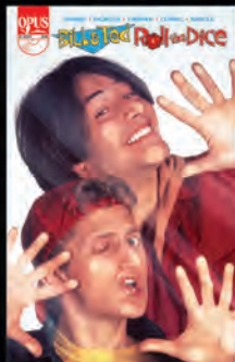
COVER B PHOTO COVER

$4.99 | 32 pg (24 story) CARDSTOCK COVER ON SALE JULY 13, 2022