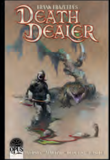
COVER B FRANK FRAZETTA

$4.99 | 32 pg (24 story) CARDSTOCK COVER ON SALE JULY 6, 2022