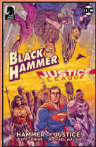
BLACK HAMMER/ JUSTICE LEAGUE: HAMMER OF JUSTICE #1 DARK HORSE COMICS/ DC COMICS