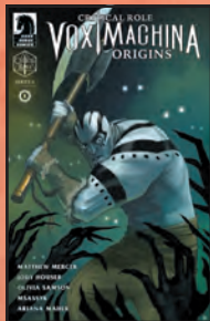
CRITICAL ROLE: VOX MACHINA SERIES II #1 DARK HORSE COMICS