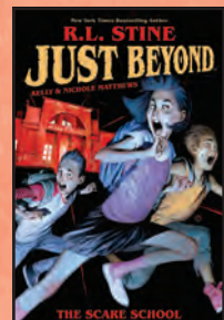
JUST BEYOND: THE SCARE SCHOOL OGN BOOM! STUDIOS