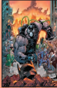
BATMAN #75 DC COMICS