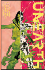
UNEARTH #1 IMAGE COMICS