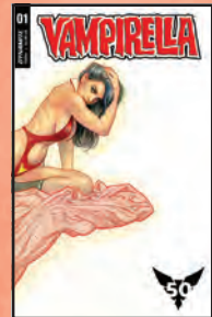
VAMPIRELLA #1 DYNAMITE ENTERTAINMENT