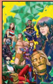
DOOM PATROL: WEIGHT OF THE WORLDS #1 DC'S YOUNG ANIMAL