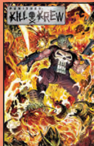
PUNISHER KILL KREW #1 MARVEL COMICS