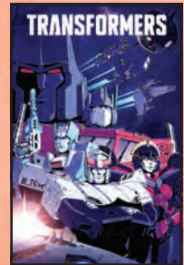
TRANSFORMERS VOL. 1: THE WORLD IN YOUR EYES HC IDW PUBLISHING